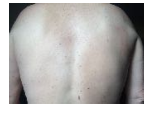
yolanda pritam hari kaur